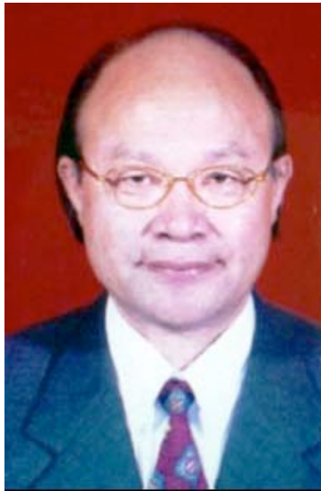
Senior Scientific Advisor, China