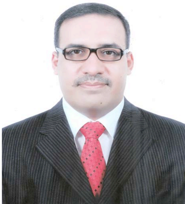
Senior Scientific Advisor, UAE