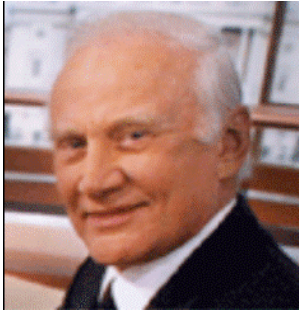
Senior Scientific Advisor