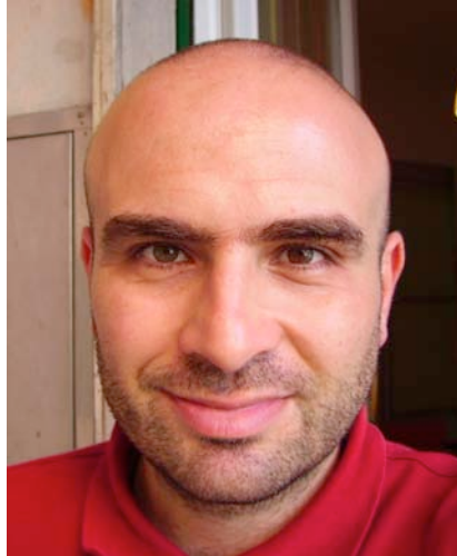
Scientific Advisor, Italy