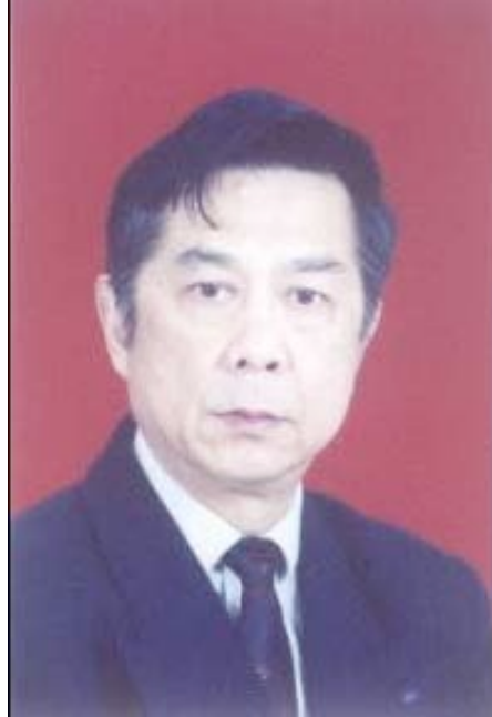
Senior Scientific Advisor, China